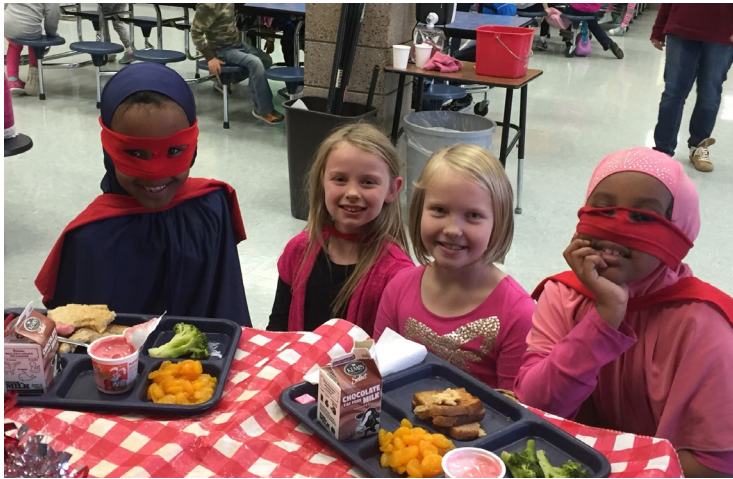
Roosevelt Elementary Cardinal STARS celebrating over lunch